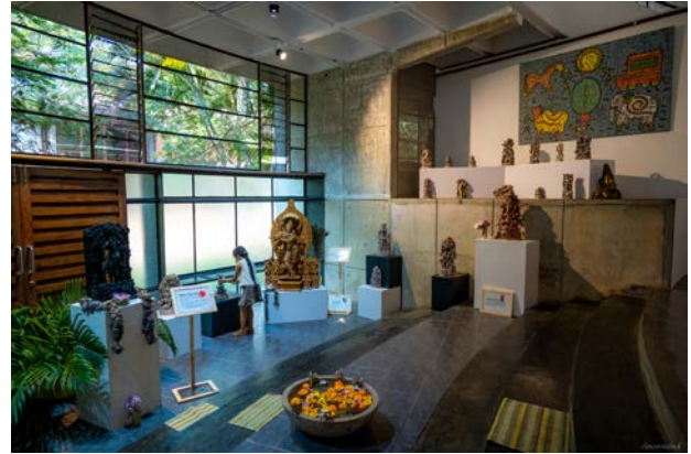
Photo: Odisha art and craft exhibition, Kalakendra, Bharat Nivas

What makes it all the more special, is the short time span in which it all was organised. This is the first Birthday Week Auroville Festival, and the idea was hatched quite close to the week itself. Much nervousness went into the unpacking: was it possible to make this wonderful idea a reality in so little time?