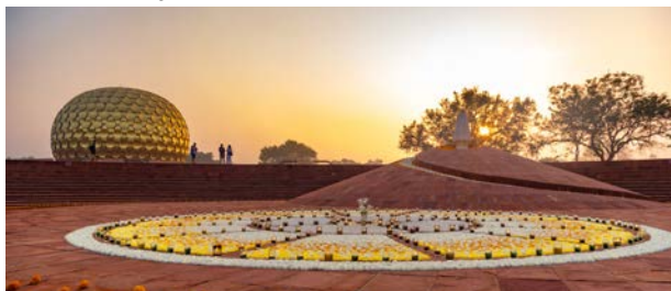
Photo: Matrimandir at dawn, on February 21st

The sweetness of the lights. The lamps, hanging in the trees on the roadside. The beauty of the banners, lit by the sun or by the lamps. Something is happening in Auroville that has not happened before. Yes, Auroville has had festivities. Auroville has organised events. Auroville has seen many spectacular performances and had many renowned speakers. It's not new to Auroville to have a kolam workshop.