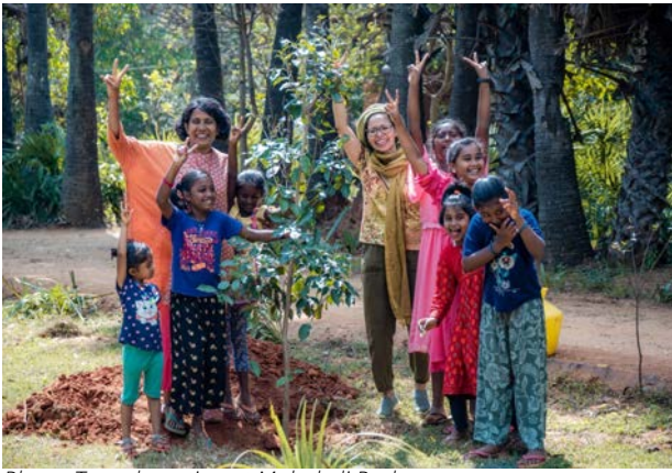
Photo: Tree plantation at Mahakali Park

For the first time, Auroville is celebrating the "Birthday Week" with a full-fledged Auroville Festival. From Mother's 144th birthday through Auroville's 54th birthday, the whole week is packed with events, several of which happen at the same time. There was so much going on that one had to choose where to go and what to miss, or what to watch later online. Almost all events were recorded, and could be enjoyed live and can still be enjoyed from home at the below link: