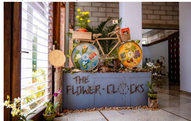
Photo: Divine Flowers exhibit at Savirti Bhavan

But this year, everything is new. It is different. The atmosphere has changed. The thrills of the newness, the freshness, the vibrations of the new dawn are more present than ever. Four years after the announcement of the new phase for Auroville, felt already at the celebrations for the half century milestone, the reality of the shift is now palpable. Visible. Liveable. It has become an experience in reality.