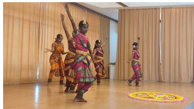
Photo: Performance by Children of Auroville at the Inauguration Festival at Unity Pavilion

There are dance and martial arts performances, musical offerings, peace chantings, exhibitions, documentaries on Sri Aurobindo's and the Mother's lives and yoga, dinners from different cultures, free food stalls, webinars on the topics of Auroville and its foundation and founders, meditations, children's activities: so many Aurovilians are coming together to offer their talents and skills for the enjoyment and enrichment of all. Each one of them is giving himself or herself freely and it is with great humility that we thank them for their gracious service.